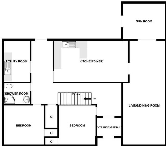
GROUND FLOOR 1183 sq.ft. (109.9 sq.m.) approx.