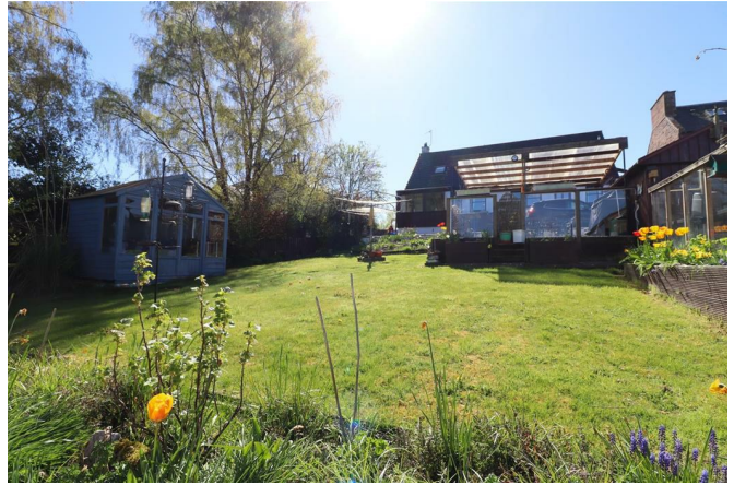
REAR VIEW OF PLOT